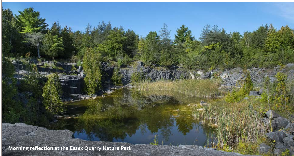
Morning reflection at the Essex Quarry Nature Park

permanent trails, protect natural communities, save farmland for present and future food production, and preserve the beautiful scenic vistas people see as they hike the trails, bike the roads, and travel between the historic communities.