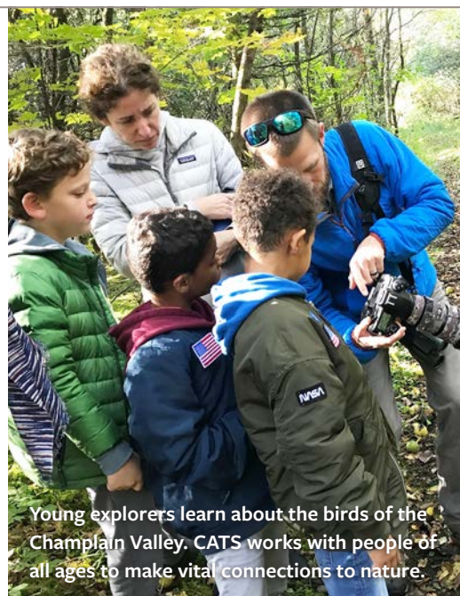
Young explorers learn about the birds of the Champlain Valley. CATS works with people of all ages to make vital connections to nature.