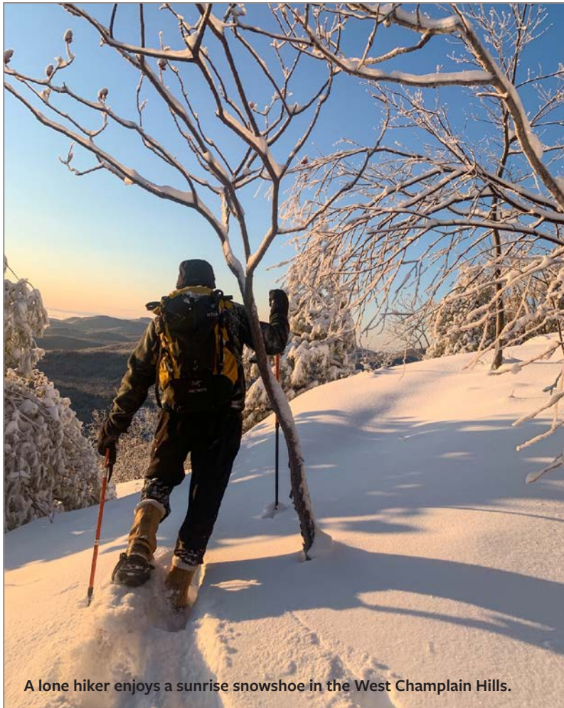
A lone hiker enjoys a sunrise snowshoe in the West Champlain Hills.

In addition to making public trails on the land we protect, Champlain Area Trails works with private landowners to allow trails on their properties. The trails go through woods, fields, and along streams, some venture up to scenic overlooks, and most advance the goal of having town-to-town trails that link our Champlain Valley communities. Access to nature on trails benefits everyone’s quality of life, boosts outdoor tourism, and fosters an appreciation for conserving the lands and waters of the Champlain Valley.